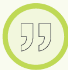
Conventions of language (spelling, grammar and punctuation)